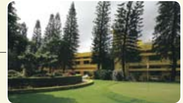
Dynamatic® Corporate Office Bangalore, India