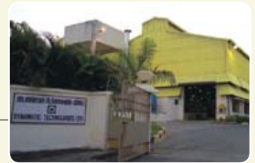
Dynametal® Chennai, India