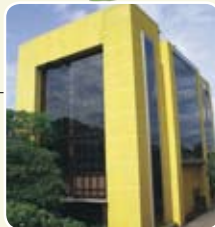
JKM Science Center Bangalore, India