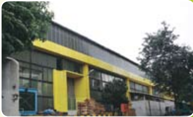
Dynamatic® Hydraulics Bangalore, India