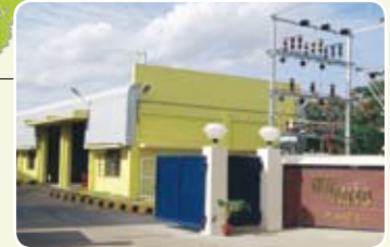
JKM Automotive™ Chennai, India