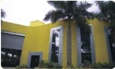
Dynamatic® Aerospace Bangalore, India