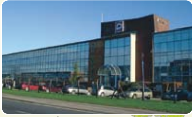
Dynamatic® Hydraulics Swindon, UK

All our facilities are designed with the environment in mind, are energy efficient and highly productive.